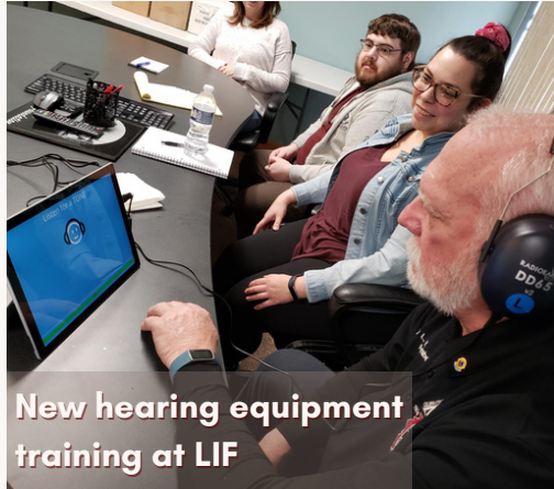
New hearing equipment training at LIF

Thanks to your help, we are changing the lives of students with low vision, as well as those of their families. On behalf of The Chicago Lighthouse and the students we serve, thank you to the Lions of Illinois Foundation, as well as the local Lions chapters that contribute to it, for your continued support.