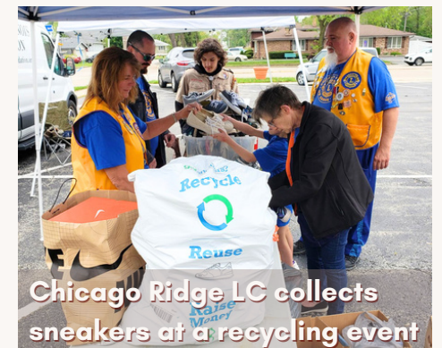
Chicago Ridge LC collects sneakers at a recycling event