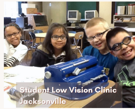
Student Low Vision Clinic Jacksonville

This in-school outreach program helps children with low vision, grades K-12, all throughout Illinois receive diagnostic services and optical devices completely free of charge. These children get more confident through increased independence, participate more in the classroom, engage in P.E. and improve academically. They are more able to navigate their surroundings and are happy to be able to find the school bus at the end of the day! Imagine that, and then consider the huge impact all of this has on their success and self-esteem, in school and beyond. We could not have achieved these accomplishments without your generous support. Thank you so much, Lions of Illinois!