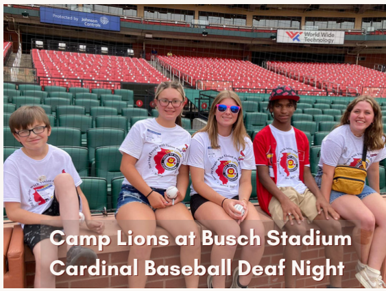
Camp Lions at Busch Stadium Cardinal Baseball Deaf Night