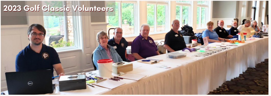
2023 Golf Classic Volunteers