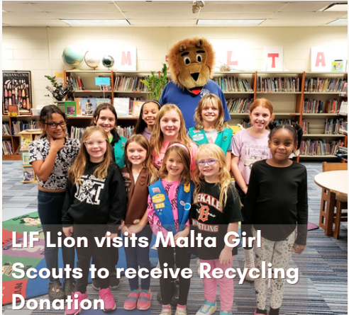
LIF Lion visits Malta Girl Scouts to receive Recycling Donation

I appeal to you Lions, you who have your sight, your hearing, you who are strong and brave and kind.