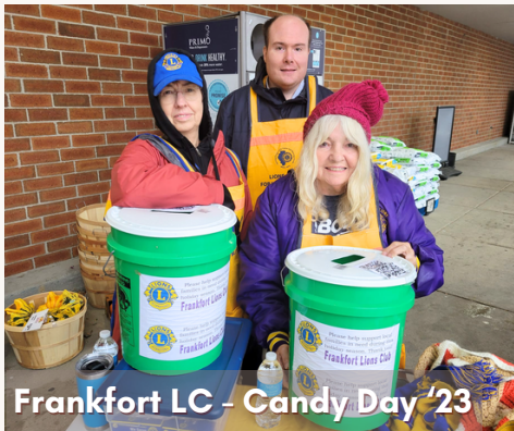
Frankfort LC - Candy Day '23