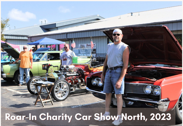
Roar-In Charity Car Show North, 2023