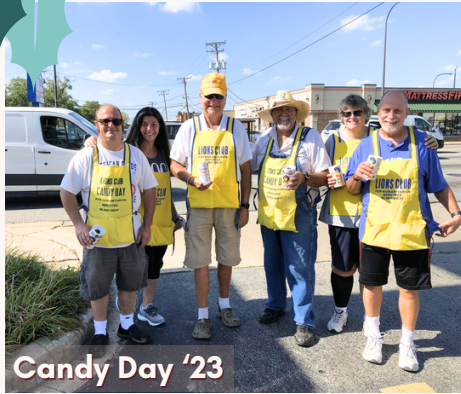
Candy Day '23