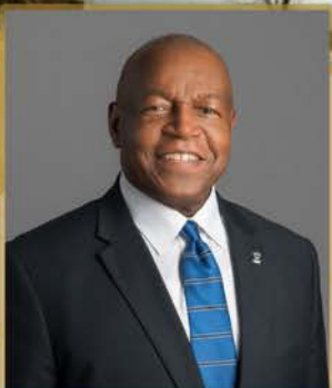
Special Guest Speaker: Douglas Alexander