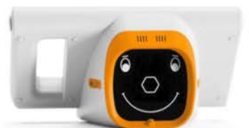
Plusoptix S12 Camera

The Lions of Illinois Foundation has collaborated with Plusoptix in order to use the Plusoptix S12 Camera to perform free vision screenings for the children of Illinois, specifically those in the formative years of infancy and early childhood. Screenings will be provided by trained Lions in each district. To learn more go to www.LionsOfIllinoisFoundation.org