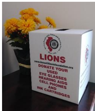
Collection boxes are available in multiple sizes.

PLEASE PRE-SORT EYEGLASSES SEPERATING PLASTIC FROM