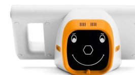
Plusoptix S12 Camera