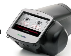
Welch Allyn SPOT Camera

Screening the vision of children 6 months to 6 years of age